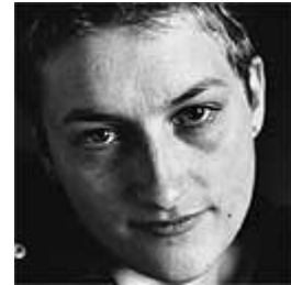
Rhapsodic tenderness... Sarah Kane's plays have gained remarkable popularity in Europe.

In Britain, Sarah Kane has become a strangely marginal figure. The playwright, who committed suicide in 1999, shocked us rigid with Blasted and bequeathed us a posthumous poem in 4.48 Psychosis , but has not entered the theatrical mainstream. Performances of her work outside the university circuit are startlingly rare. In the rest of Europe, however, Kane is widely regarded as the most significant dramatist to have emerged from any source in the past decade. Why this staggering disparity of perception?